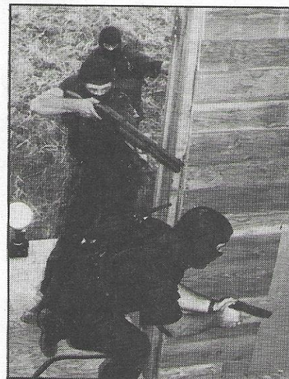
BENELLI SUPER 90 ..... 68