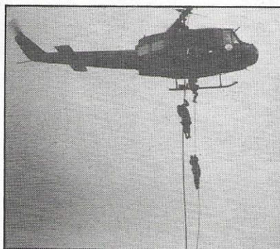
FAST ROPING ..... 32